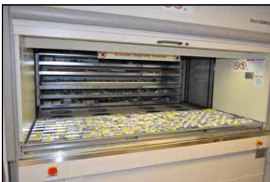
The Lean-Lift® stores parts of all shapes and sizes.

Before: The parts department was dark and confined, not appealing for customers, and most parts were on the second floor, not ideal for employees.